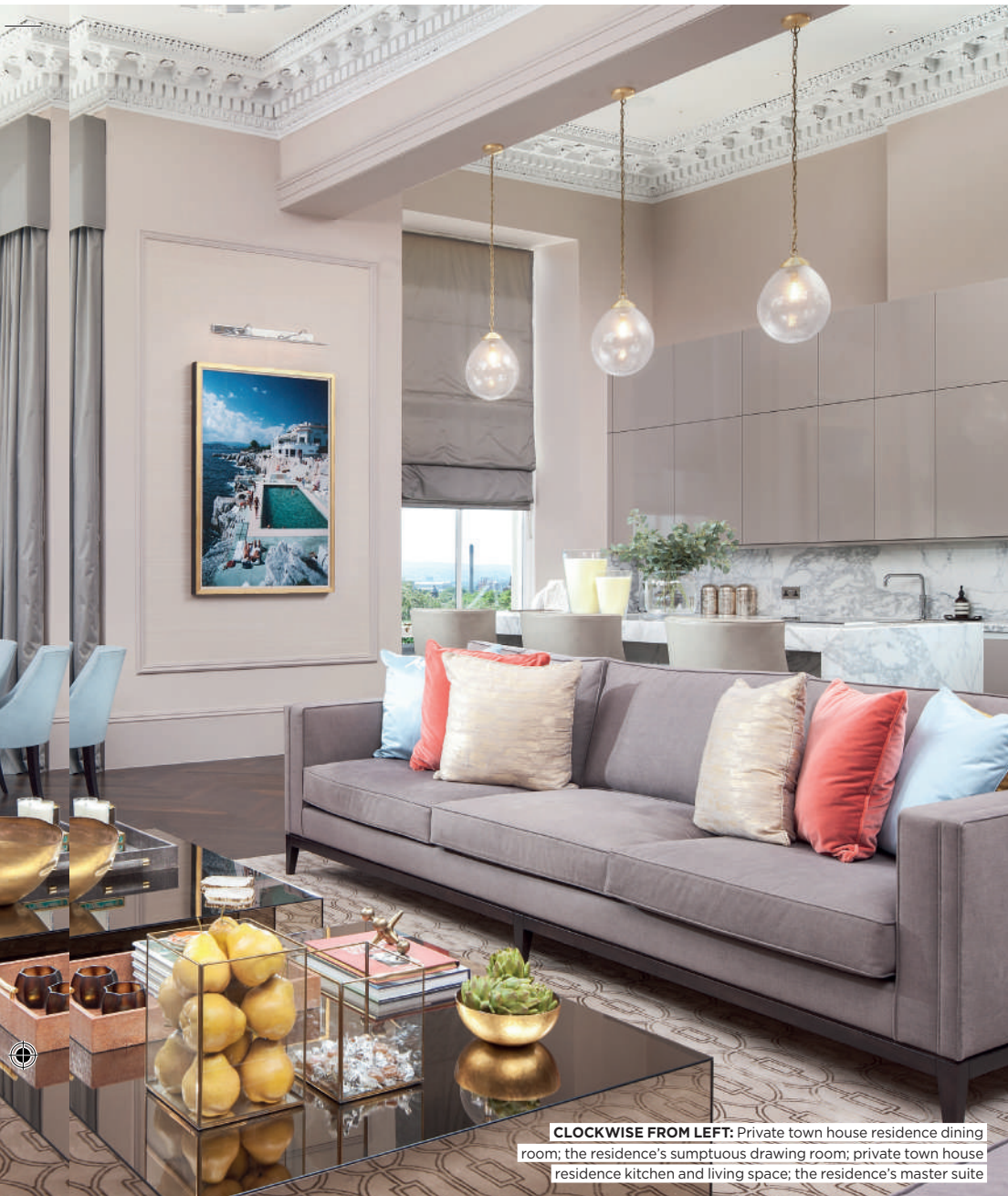
CLOCKWISE FROM LEFT: Private town house residence dining room; the residence's sumptuous drawing room; private town house residence kitchen and living space; the residence's master suite

timeless designs.' Typically, a residential interior might bring together vintage and salvaged pieces with specially commissioned furniture, reflecting the owner's character and interests, or, where appropriate, existing schemes may be refurbished instead of replaced.